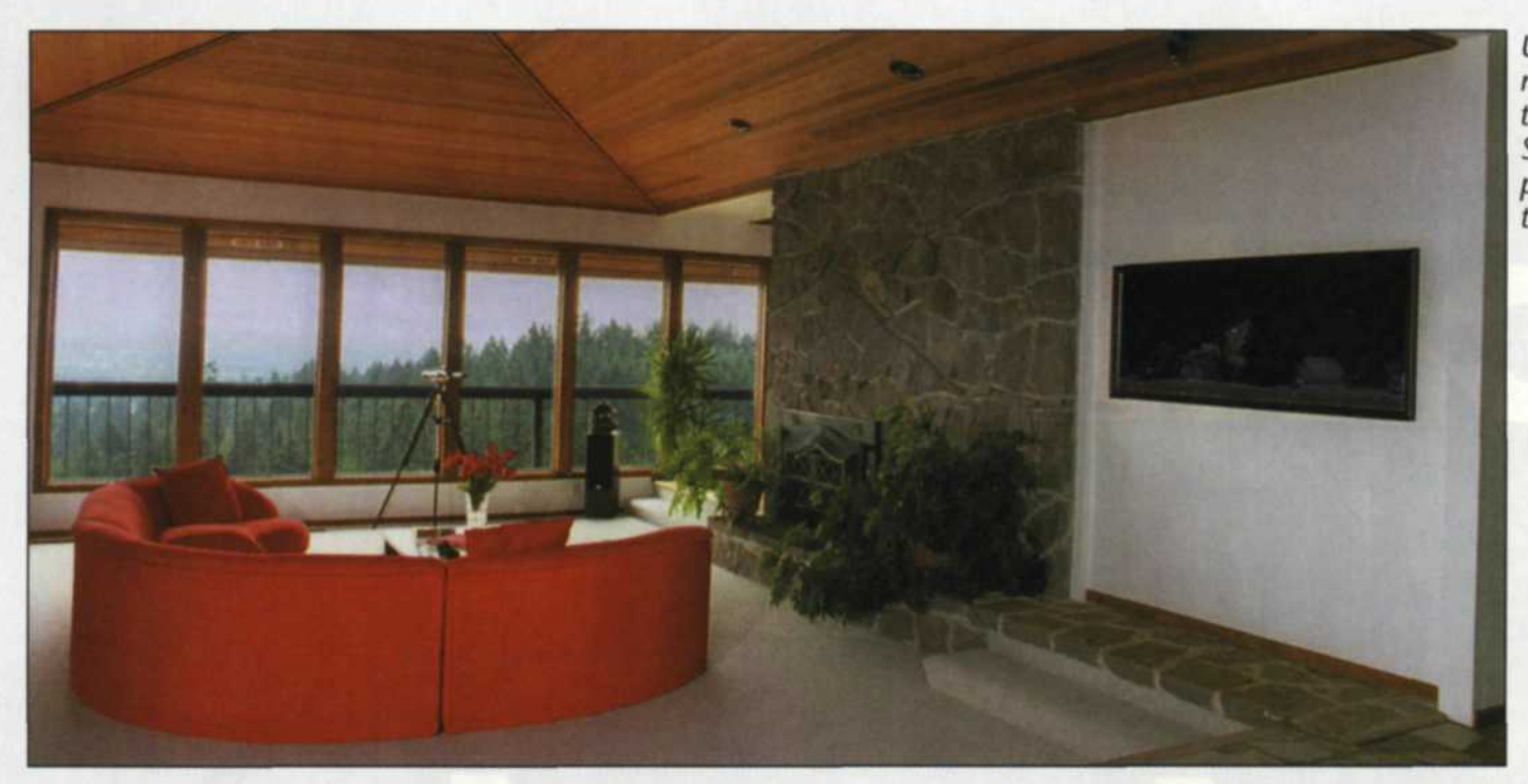
Using Room 01, Window and the new mask, the images are blended together using the feather too. Some fine tuning was then accomplished in the problem areas using the clone tools.