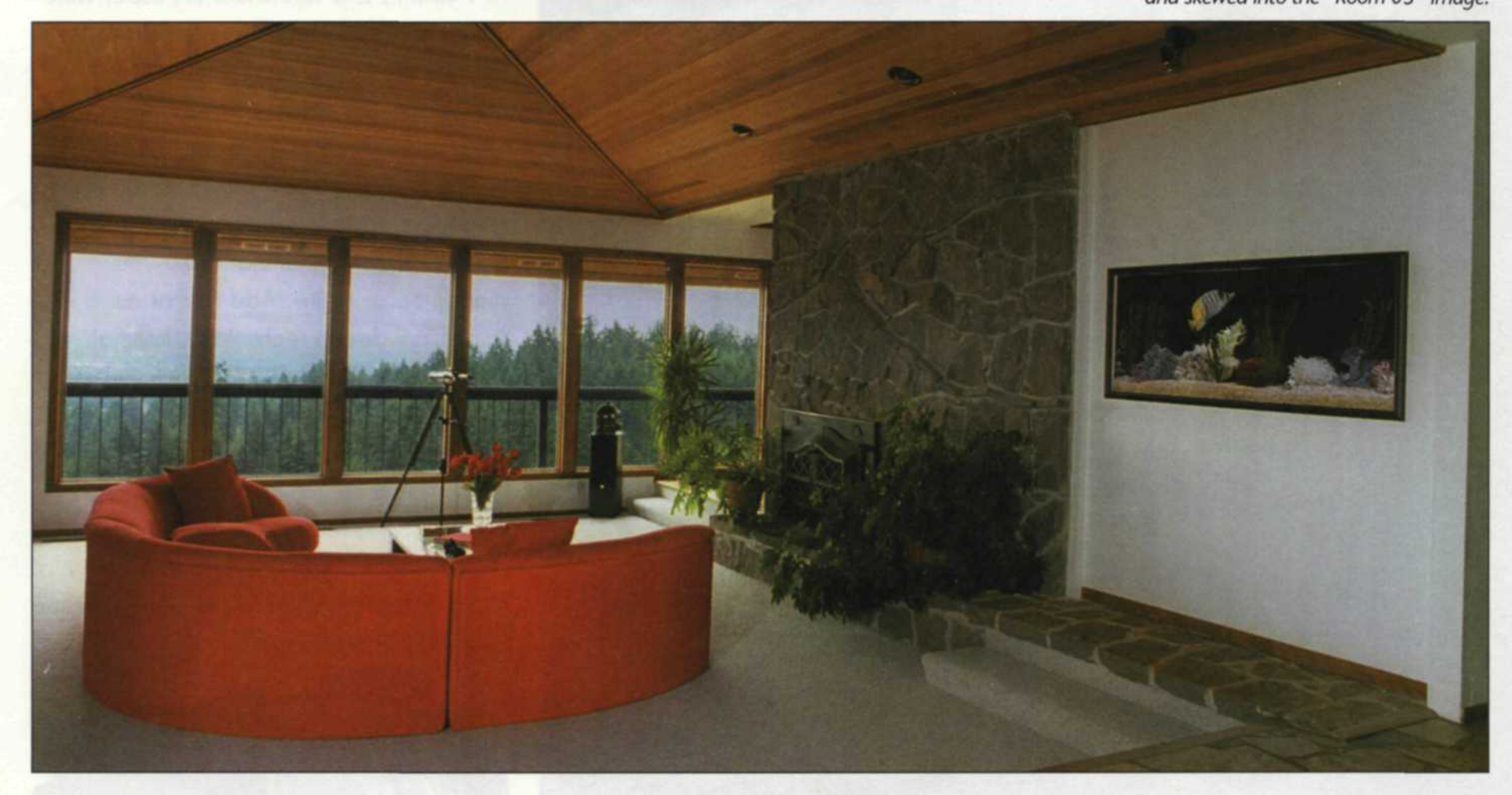
Single image of fish was scanned, copied, pasted and skewed into the "Room 03" image.

board. Going back to the room shot, we pasted the clipboard image of the aquarium over the aquarium in the room shot.