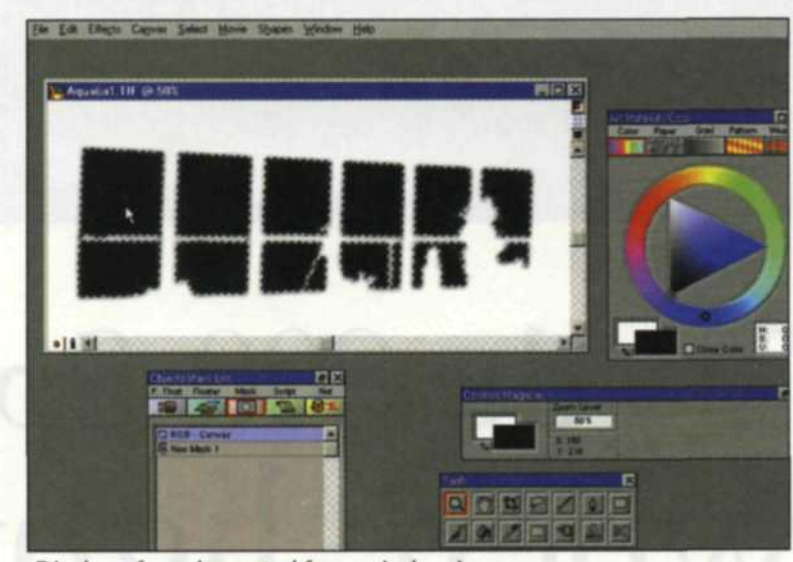
Display of mask created from window image.