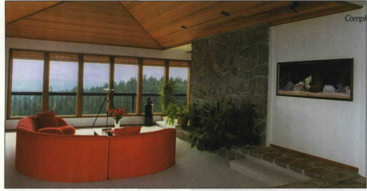
Completed image of inserted tank image.