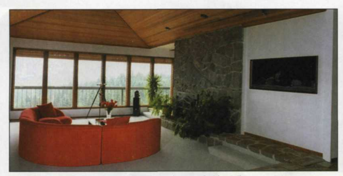
Original shot on 35mm color negative film and scanned with a Nikon scanner.