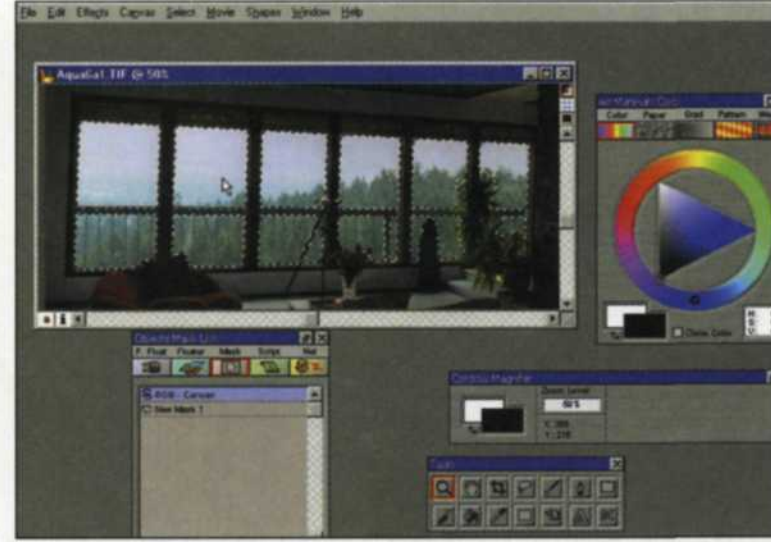
Using the magic wand to select the area inside the windows.